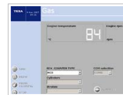
Selected display of the interface used for reading the RPM (in this case, RC3)