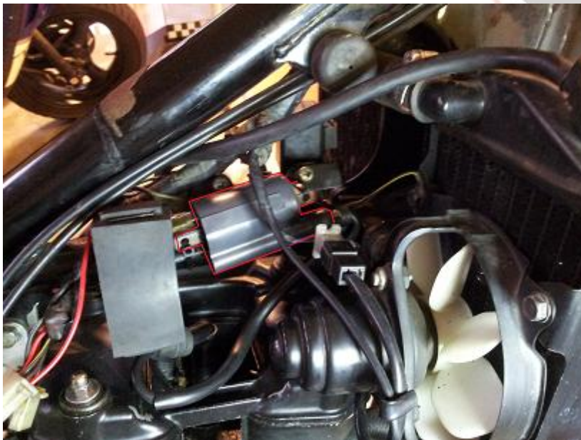
location of the ignition coil, under the fuel tank.

- Since this is a TCI ignition coil, one side has to be attached to 12 Volt . You can do this by attaching the red wire to the + pole of the battery. Then attach the other side of the wire to the pin of the TCI ignition coil with a “ + “ sign next to it.